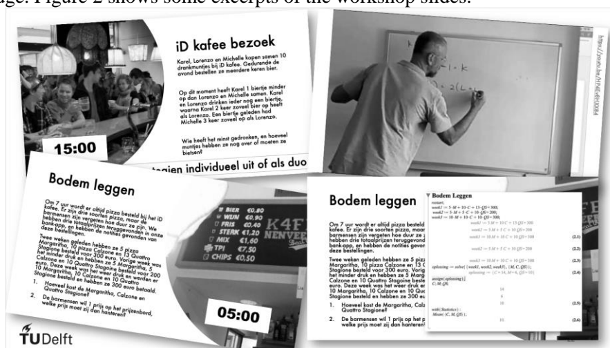
Figure 2. Excerpts of a workshop: starting the workshop with a challenging problem students cannot solve with prior knowledge (top left), followed by a video-instruction explaining the concept (top right), after which students can work on a similar problem they can solve (bottom left) with its solution (bottom right)

The workshop uses a time-guided set of workshop slides that introduce students to the challenging problem of the week, followed by a recorded instruction video and a problem they can solve using their new knowledge. Figure 2 shows some excerpts of the workshop slides.