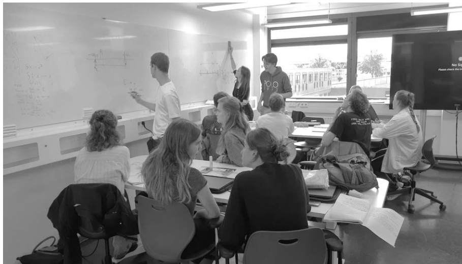
Figure 3. Collaborative learning solving engineering problems using the whiteboard as a central tool

With 335 students in the course, we have divided the students into 14 studios, consisting of approximately 25 students coached by one teacher or teaching assistant. To facilitate a collaborative and engaging learning experience, each studio is equipped with a large screen that displays the workshop's materials. This technology allows students to easily follow along with the lesson and stay engaged throughout. Students are seated at tables with five to six peers creating an atmosphere of teamwork (Figure 3). The tables are outfitted with materials to participate fully in the workshop, including computers, whiteboards, and a wide range of materials like paper, markers, callipers, weighing scales, screwdrivers, and more.