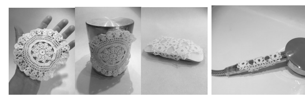
Figure 1. Creative connections from the unknown to the known

The first part of the exploration was based on students' close relationship to everyday products and how this can be used in new ways. The idea was that this would be transferred to 3D printing, with the process moving from something that was known to something that was unknown. It was important that there should be learning during this process. A piece of lace with a circular pattern, a familiar and traditional handicraft product, was used as the example of a patterned gripping surface (Figure 1). If this were a finished product such as silicone, it could be attached to products in the home or in hospital corridors as an aid for better grip. The lace was placed in different places (e.g. the palm of the hand, a coffee box, a computer mouse and a shower head) to create a better grip.