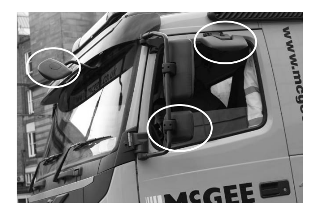
Figure 1. Image of additional mirrors

shown in figure 1. The Construction Logistics and Community Safety body (CLOC's) also recommend audible sensors and vision cameras to be utilised to eliminate or minimise blind spots as much is practically possible (CLOCS 2015). All these measures are already employed on McGee's fleet and whilst such methods improve visibility there are still limitations, particularly in identifying the blind spot for tipper drivers when turning left.