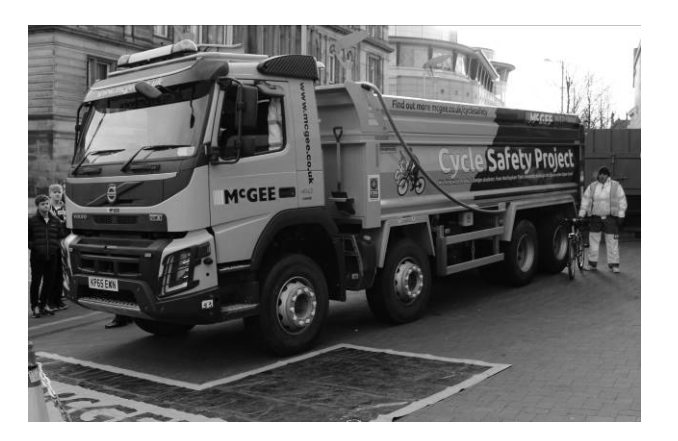
Figure 2. Exchanging Places Exercise

To launch the brief representatives from McGee and the Metropolitan Police delivered presentations outlining the above problem to students as well as the difficulty of developing a solution that is both road and construction site suitable. These presentations were interspersed with videos that demonstrated near miss scenarios and the extent of the blind spots on such vehicles. Following these introductions the brief was delivered. Students were taken outside to a new Volvo XF4 McGee tipper wrapped with vinyl promoting the partnership, see figure 2.