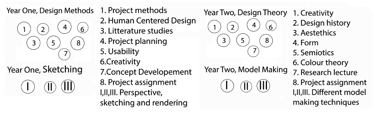
Figure 1. Current course disposition, 1-8 theoretical content and I, II, III practical content