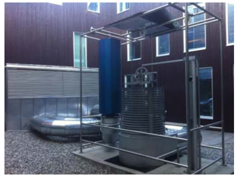
Figure 2A and 2B: 2A: Step two 'Pulse' real-size installation on site; first version. It was a failure because the air from the ventilation system did not move the hammer. Figure 2B: Step three: 'Pulse' real-size installation on site; second version, including a frictionless bellows, and where all functions were safeguarded and resolved according to the original concept

Pictured above is the solution initiated by the artist and completed by the engineering company, as it appeared when it had been delivered in full scale onsite. The blue cylinder part in aluminium was as intended, while the other part was a solution that was complicated and expensive but not fully functional. It contained two chambers scheduled for pulling and lifting the 'hammer', intended to turn into the cylinder at different heights. When it turned out that it was impossible to get it to work as intended, new layers of new parts were gradually added to compensate for the lacking function. All this happened without success. It all took a very long time, and gradually recognition grew in the engineering company that it would not be possible to construct and produce the project as intended. The conclusion was that the artist took over the project again and involved new partners for further development.