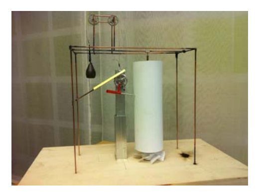
Figure 1. Step one 'Pulse': A mock-up of the public art sculpture in paper, steel and polypropylene; a hammer that leaves marks on a cylinder

The artwork was titled 'Pulse'. The title alludes to the artistic concept of enhancing the connection between the sculpture and the pulse of the house through the ventilation systems in the building. It was intended to be placed in an enclosed outdoor space, an atrium, so that it would be limited and not physically accessible to people. The sculpture was based on the draft from the two ventilation systems, which were dynamic and reflected the activity in the building. Many people in the building lead to more pressure in the building. The sculpture would respond to this and work according to the activity in the different parts of the house. It was a kinetic sculpture that was functional and operated by air from two separate ventilation systems. Physically, it consisted of two main parts (Figure 1). One was a vertical aluminium cylinder rotated by using the air from one of the ventilation systems. The second part was driven by the second ventilation facility to lift and pull up a 'hammer', which was jacked up until it reached a certain point, after which it would fall down and leave a mark on the cylinder. This mark would, in principle, not hit the same place twice and would, over time, change the cylinder's appearance and shape.