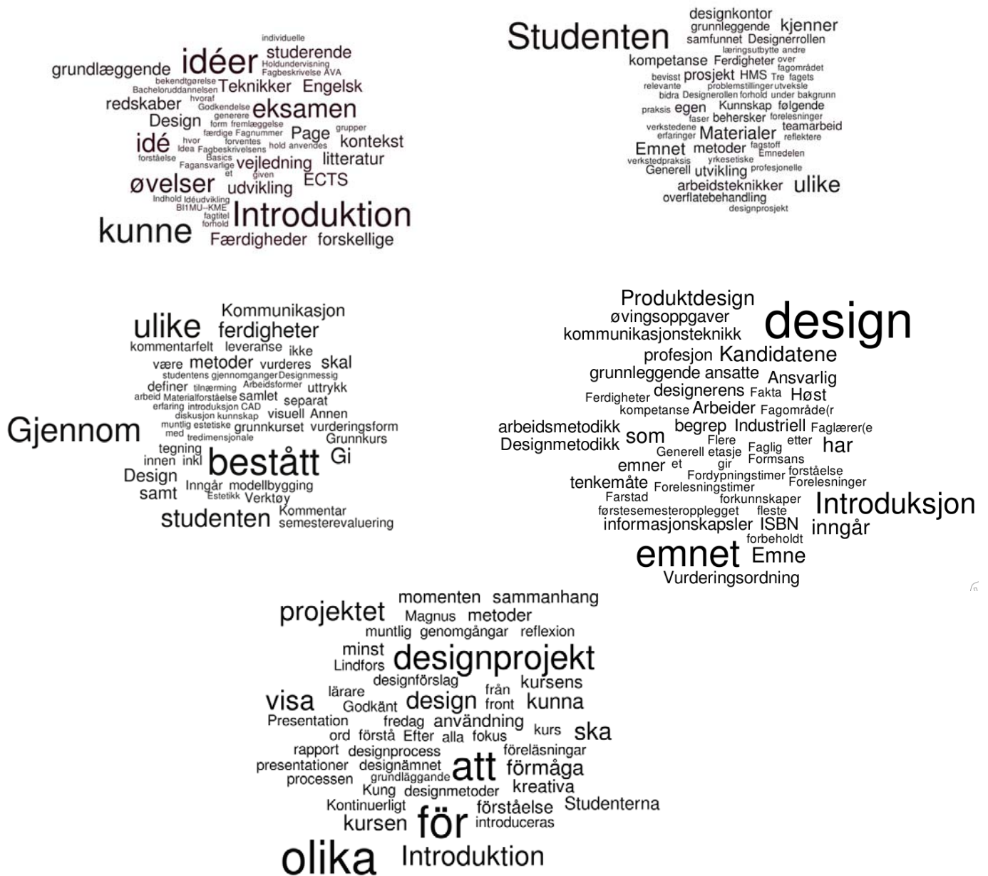
Figure 1. Word clouds illustrating introductory course descriptions at five different universities in Europe

We analyzed the introductory course descriptions at five different universities in Europe. We found that they had a common emphasis on basic skills and knowledge. All of the descriptions of the introductory courses present the idea of basics for design education. Design basics are described as