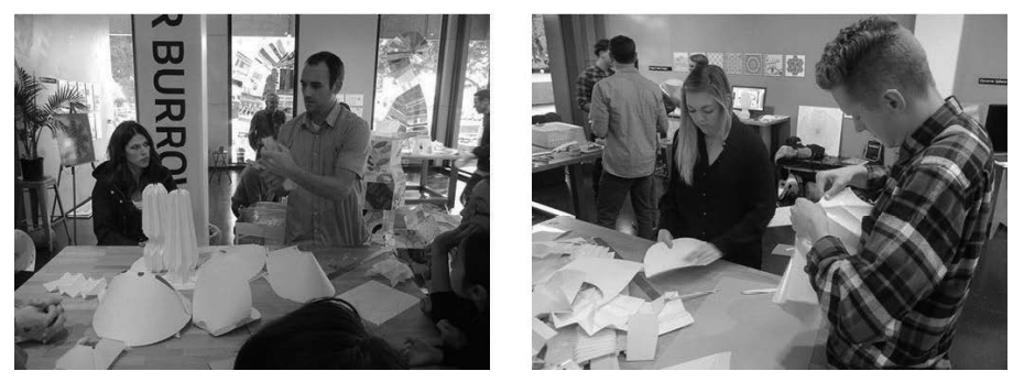
Figure 4. Student volunteers instructing; participants at 2<sup>nd</sup> lamp making workshop with folding emphasis

Emphasizing folding as a design and making activity enabled participants to progress further than in the non-folding workshop. It appears their production benefitted from a more focused direction and greater skills toolbox to draw from. Although it's unlikely the participants were completely lacking folding experience, we believe the folding instruction could have provided the participants with some new information that developed into skill acquisition during the workshop. [Figure 4] Folding activity also produced an enhanced atmosphere of energy and excitement, as well as open sharing with a general attitude of play.