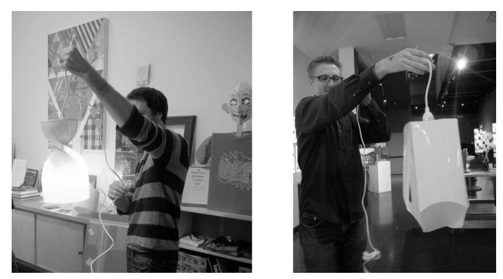
Figure 5. Participants show results from 1<sup>st</sup> (left) and 2<sup>nd</sup> (right) workshops

Some of the written review comments we received from the participants expressed their perceptions this way: "It was fun, pushed my creativity, great materials and tools. Tactile/hands-on learning experience." "I am a bit impressed with my ability to go from an idea to a tangible working product." "Exploring ideas through quick physical prototypes is more informative than ideation sketching in terms of how elements come together." "My project changed three times over the course of an hour-this was a great opportunity to explore the materials with minimal risk."