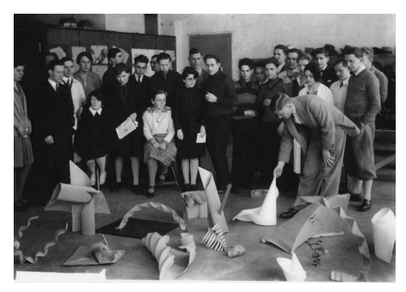
Figure 1. Albers with his Volkurs course students

Perhaps the first well-known example of paper folding as a design learning activity was assigned by Joseph Albers in his Volkurs course at the Bauhaus. [Figure 1] He asked his students, through tacit exploration, to discover paper material properties and potential as they created folded objects for study and reflection. Students' results revealed underlying properties of paper that demonstrated potential exploitation as a design medium. [1]