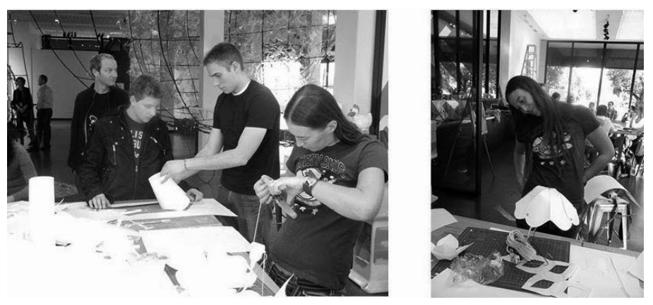
Figure 3. Participants and student volunteer at 1<sup>st</sup> lamp making workshop

Student volunteers acted as coaches, assisting participants with technique and how-to type questions, and helping participants reflect [6] on the process of designing/making as it was occurring. The professor and students were able to provide individual attention to participants as the venture progressed. This interaction allowed the students to be the "instructor" for a time, which many reported, "opened their eyes" to the learning dynamic as it related to their university studio experience. [Figure 3]