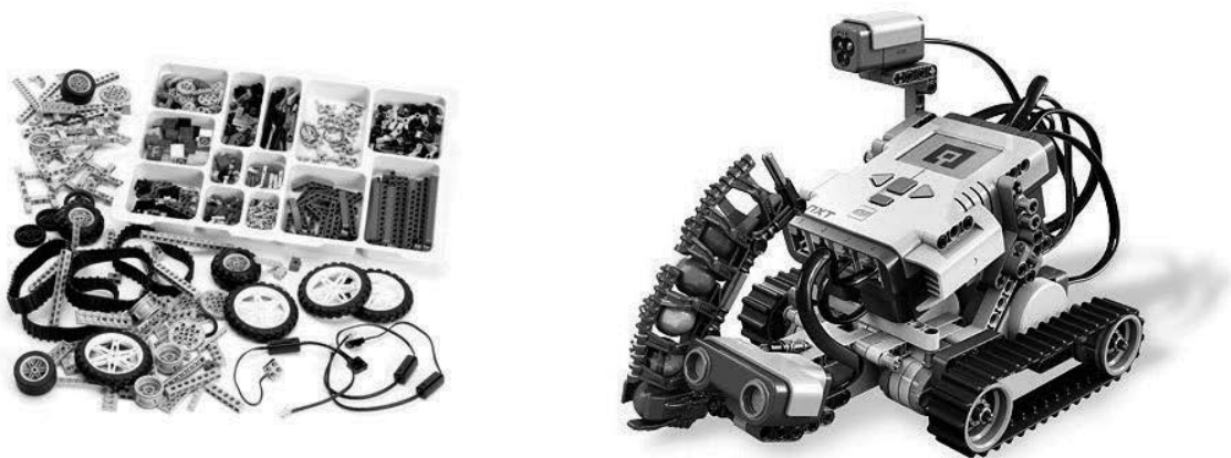
Figure 3. Lego Mindstorms assembly kit and assembled robot ( www.lego.com )