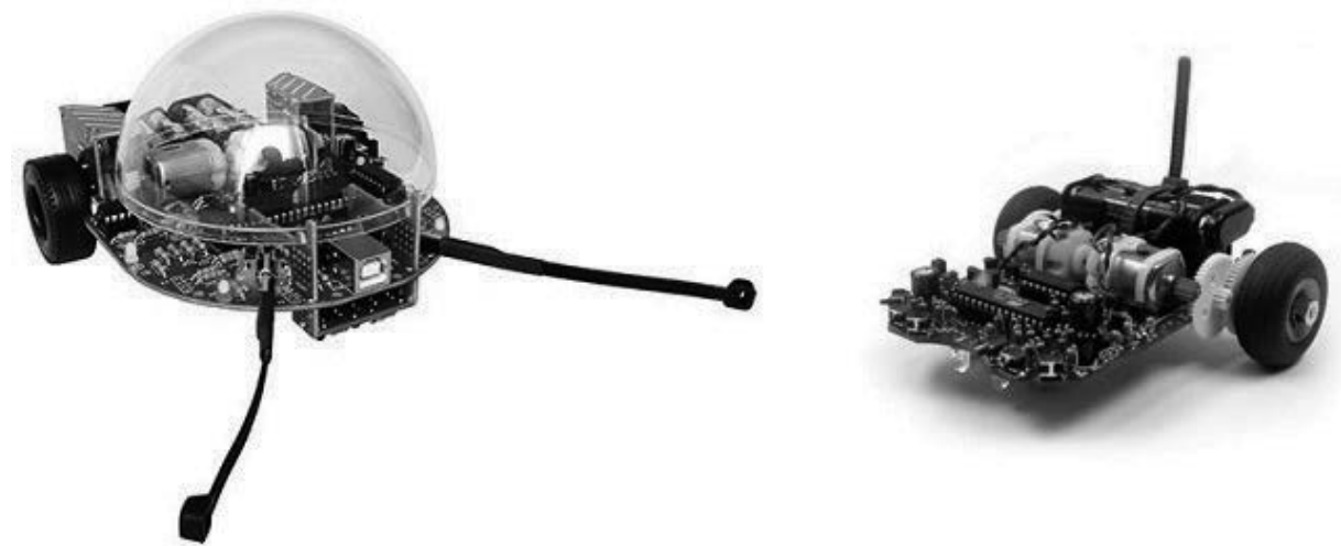
Figure 2. NIBObee ( www.nicai-systems.com ) and Asuro ( www.arexx.com ) assembly kits

Former courses used construction kits which had to be soldered by the students themselves. Two different kits are shown in Figure 2. The main disadvantage of those construction kits is the soldering and assembly process which is time consuming and often results in inaccurate and defective robots. Uncomfortable software solutions are another source of errors. Both mechanics and software handling are not focus of the course and quickly lead to frustration which is the exact opposite of what was intended.