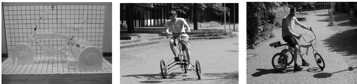
Figure 3. Physical mockup made of soft materials by Team B (left), and final working prototypes built by Team A (middle) and by Team B (right)

Without properly developed CAD models, physical mockups were made mostly based on the styling models. Materials used for mockups include foam, hardboard, wood, and acrylic pipes and plates. This mockup stage (Task 5) was conducted during the ten days that Aachen students visited Hongik University. A photo of the mockup built by Team B is shown in Figure 3 (left).