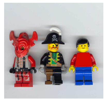
Figure 1. LEGO Mini Figure

The Mini Figure is one of the strongest icons in the LEGO brand and clearly a strong candidate for being covered by, or included in one or more platforms. However, there are several hundreds candidates as well. These candidates cover products, materials, processes, suppliers, supply chains, etc.