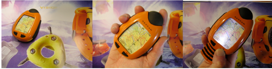
Figure 1: Model of a 'Geocam' device. Design: Stefan van Cleef, 2003.

-user group- in the mountains –environment of use-. As a special requirement, use with one gloved hand should be possible.